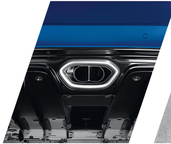
Active sport exhaust

Measuring 320mm in diameter with four-piston calipers on the front axle, the powerful Brembo brakes offer the best stopping performance on the racetrack or on a winding mountain road.