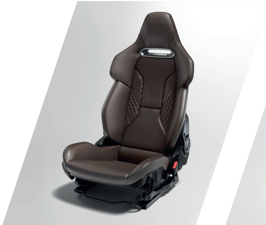
6-way Sabelt Comfort seat (available in black)