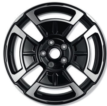
18" Légende wheels with gloss black diamond-turned finish