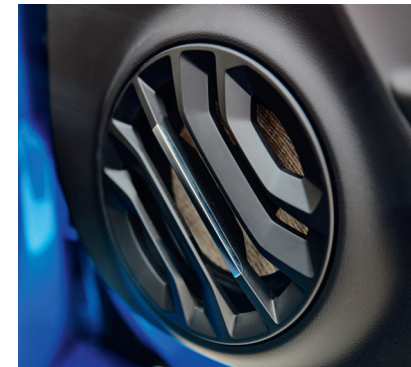
Premium Focal audio system

Focal Premium audio system for richer sound With two speakers, two additional tweeters and a subwoofer, the Focal Premium audio system delivers an enriched sound quality with deep bass notes.