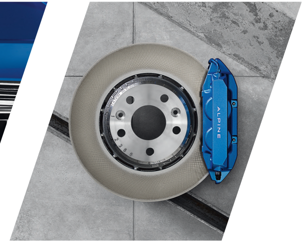
High-performance braking system