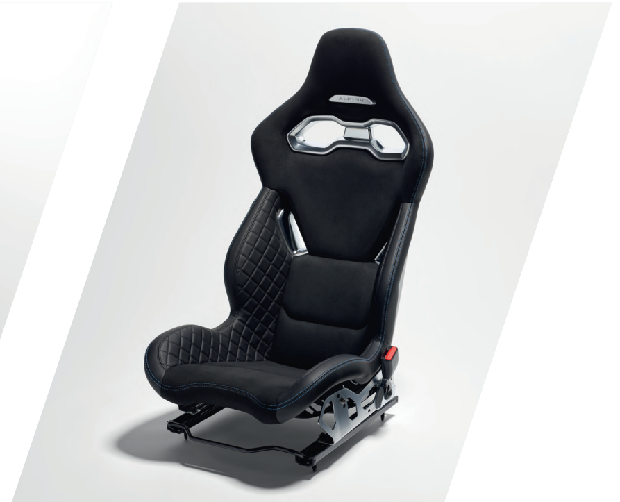
Bucket racing seats lightweight Sabelt design in black leather and microfibre upholstery