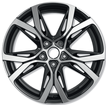
18" Dark grey diamond-turned Sérac wheels