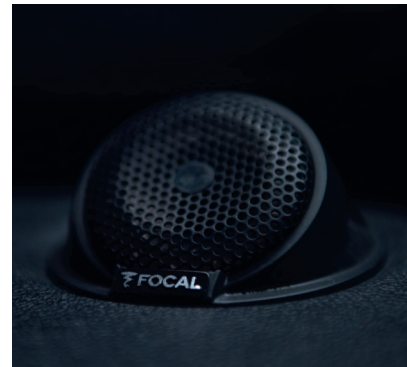
Inverted dome tweeters