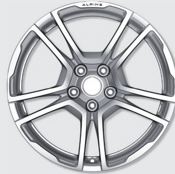
18" Fuchs forged wheels

Otto Fuchs wheels add strength and lightness 18" Otto Fuchs alloy wheels, forged to enhance strength and reduce weight, reinforce the AT10's handling, poise and agility